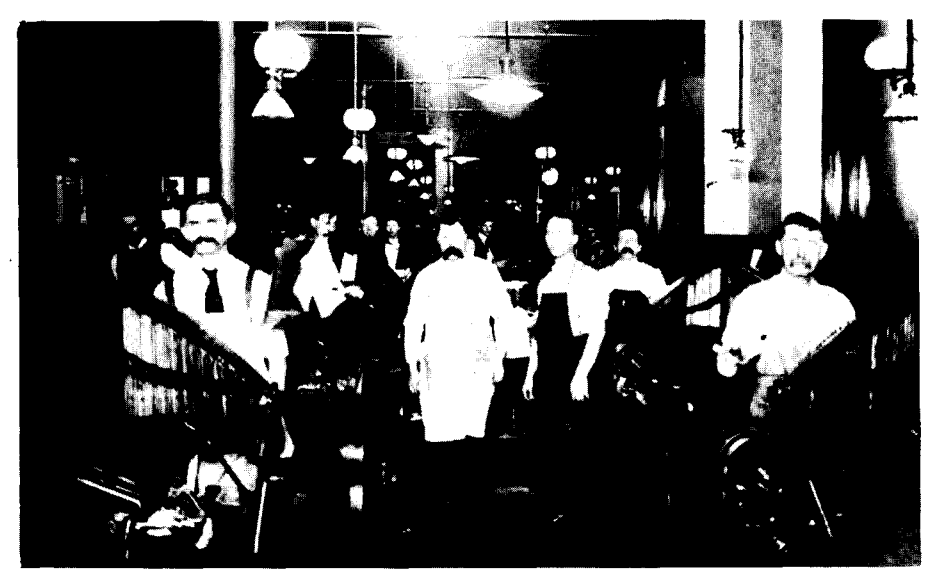
Toronto Telegram Linotype Operators (circa 1905) manning the machines which transformed the printers' world. However, by the time the machines arrived in the 1890s, the International Typographical Union was strong enough to protect its members. Former hand compositors were given all the new mechanized jobs. (Metropolitan Toronto Library Board)

working with library records in other countries have been able to reconstruct remarkable accounts of the popularity over time of particular books and periodicals.<sup>33</sup> As libraries amalgamate and pool their resources, there is an obvious role for the archivist in saving records which can help scholars in the twentieth century understand the cultural milieu of the nineteenth.