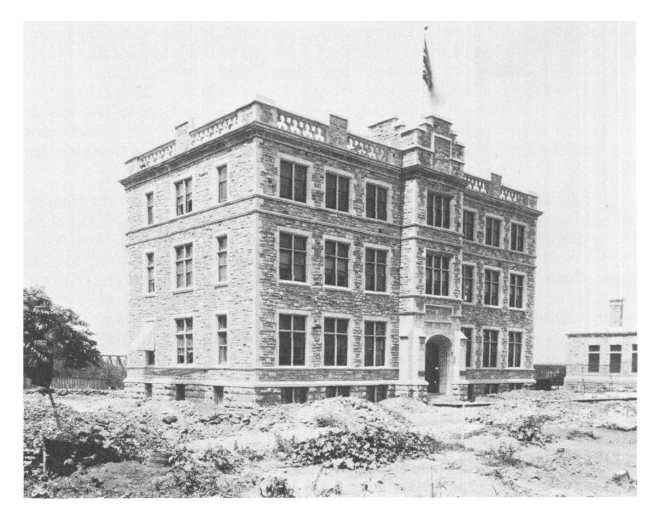
The new Public Archives building, 1904.

presented its report in March 1914. In summary, the Commission reiterated the "policy of drift" mentioned in the 1897 report and for the first time reported on the actual space used for records: 438 rooms containing 1,629,014 cubic feet, plus 92,872 drawers and 127,219 linear feet of shelving.<sup>29</sup> Most writers subsequently have interpreted the second figure as indicating actual holdings of records at over a million and a half cubic feet in 1912. However, this interpretation certainly must be incorrect, given that the volume was estimated fifty years later (by the Records Management Survey Committee in 1959) as 2.5 million cubic feet. Examining the figure in its context suggests very strongly that the Commission was referring to the actual cubic volume of space in the 438 rooms. The Records Management Survey Committee interpreted the figure to indicate about 313,000 cubic feet of records in the departments in 1912.<sup>30</sup>