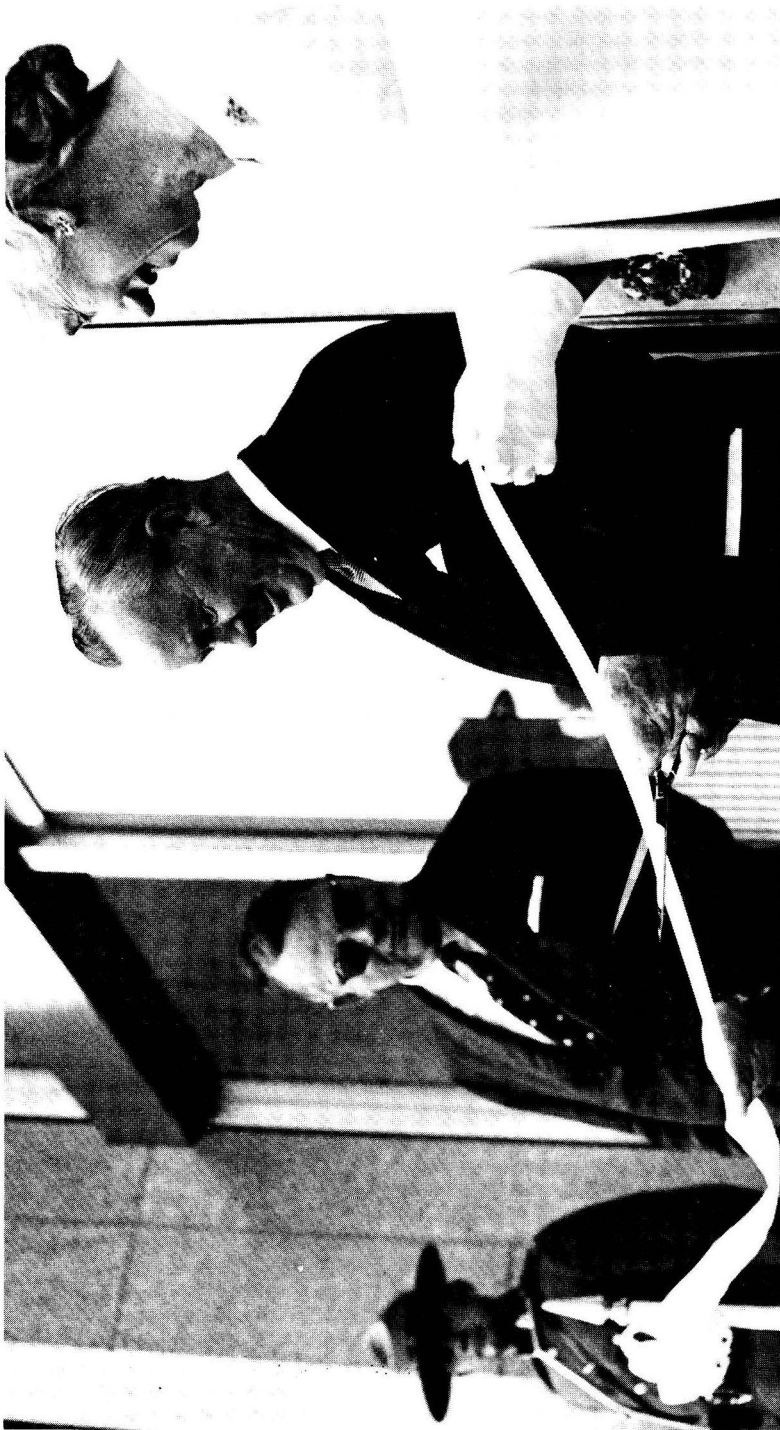
All of Dr. Lamb's efforts on behalf of archives and libraries were well supported by the Cabinet ministers who were responsible for the Public Archives and National Library. In May 1967, the new PANL building was opened by then Prime Minister Lester B. Pearson; J.W. Pickersgill and Ellen Fairclough look on. (PA 23715)