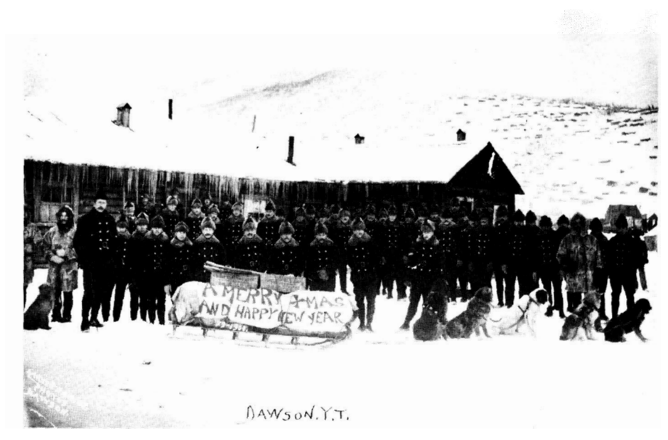
The Yukon Field Force, Dawson, Y.T., 1899. Courtesy: Public Archives of Canada, C-8401.

twenty-four pages and an indeterminate number of concluding pages were missing. As well, between the first and last entries, that is, 19 May 1898 and 27 April 1899, some thirty-one days were lost through damaged or missing entries. The loss of historical information that perished with these pages was regrettable. The absence of a front cover struck me as particularly unfortunate in that diarists usually record their names on or inside diary covers. Whether that was so in this case will never be known, but there was certainly no direct evidence of authorship on the volume in 1981.