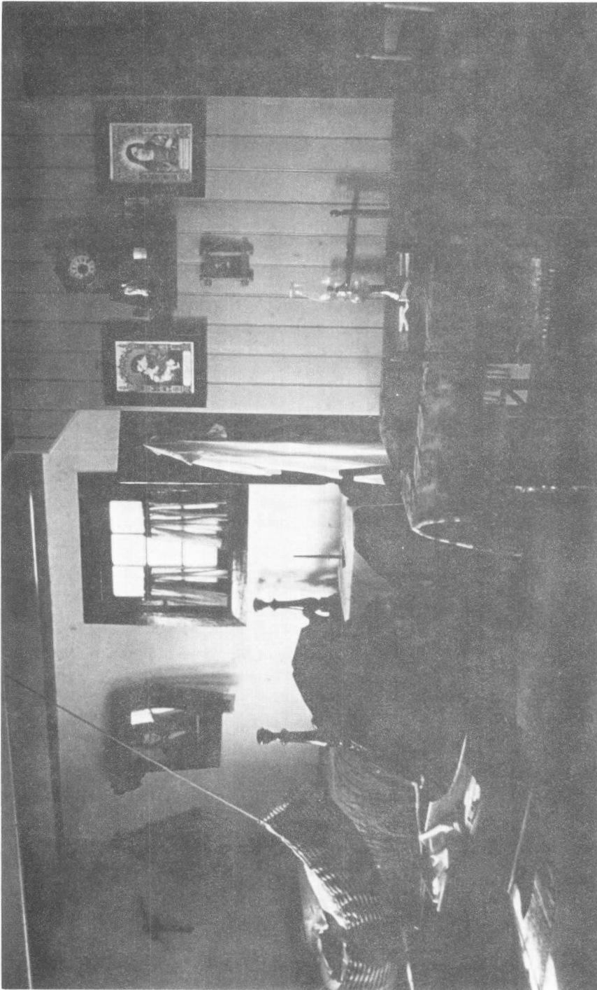
Interior view of Riel House.