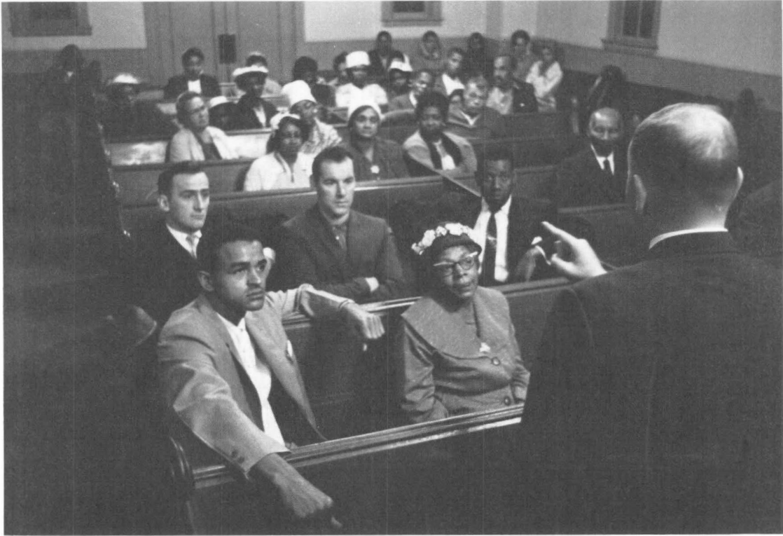
A meeting in the Seaview African Baptist Church during relocation.

Bob Brooks) from the Public Archives of Nova Scotia, and modern colour photographs (by Ted Grant) from the National Archives of Canada depict residents as well as interiors and exteriors of houses in order to illustrate Africville's home and community spirit.