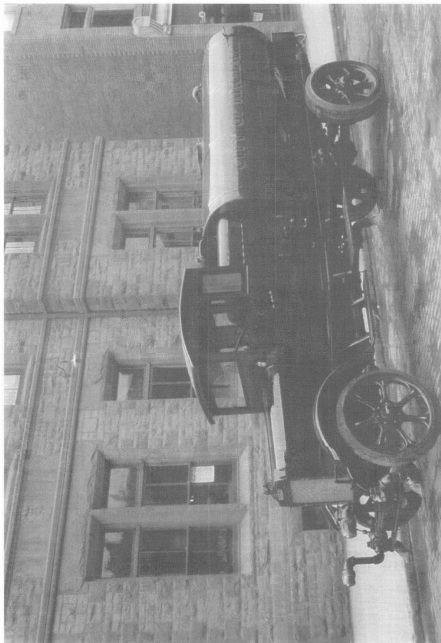
Figure 3. Flusher Ruggles chassis, Kitchener, Ont., 1920. Andrew Merrilees Collection, National Archives of Canada, PA-179443. Electronic print from 2K scan of original glass plate negative.