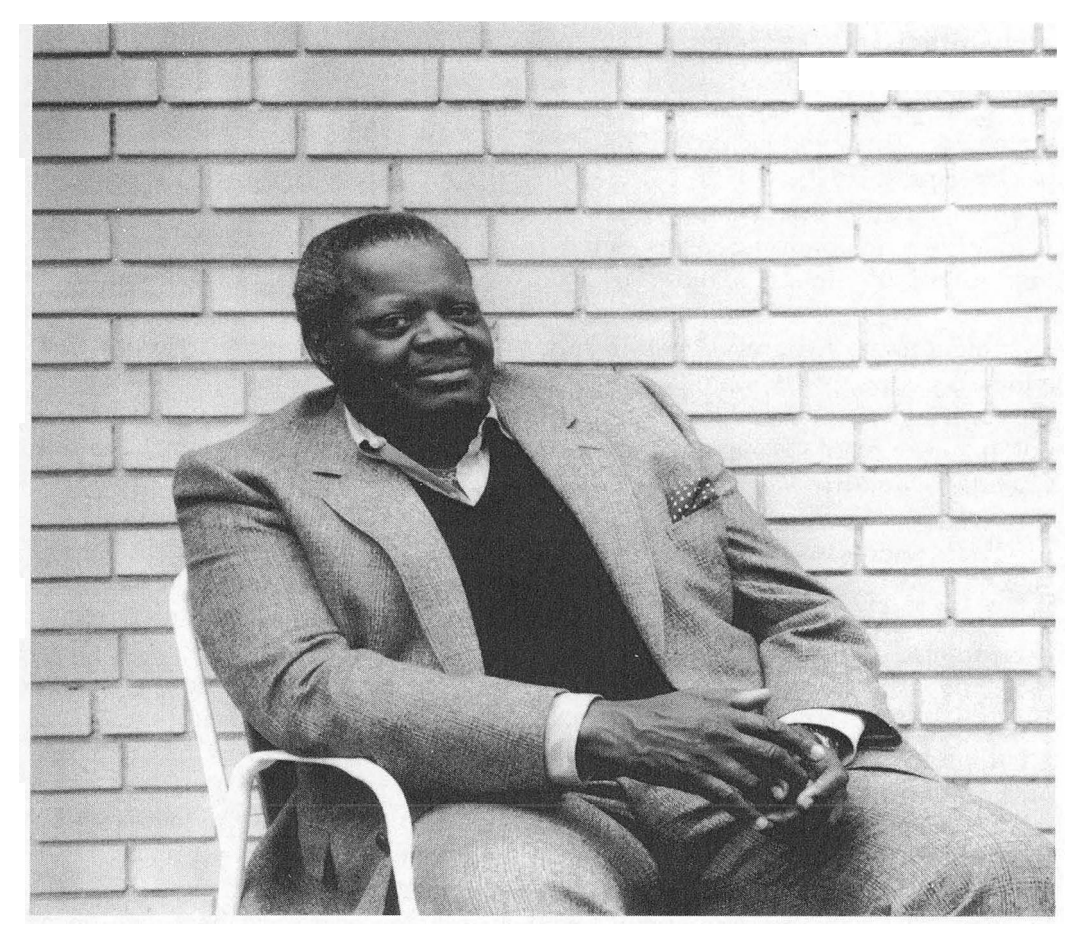
Portrait of Oscar Peterson, 16 October 1984, by Harry E. Palmer, Silver-gelatin print, National Archives of Canada (PA-182399).

their placement within the cases is quite disorderly. The text labels are inadequately placed in relation to the records, so the viewer is constantly maneuvering to see them. In addition, I question some of the display techniques, such as the lack of frames for watercolours and the vertical display of some of the more fragile images. I assume these items will be the ones to be rotated as mentioned in the promotional brochure, which, in itself, is a highlight. It is well-designed and beautifully printed, displaying some of the more captivating images from the exhibition.