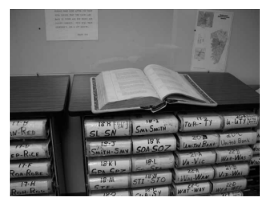
Figure 2: Deed indices in the Woodford County courthouse, Versailles, Kentucky, 2004.

the newspapers for White investors to buy lots for immediate "flipping" to African-American purchasers. White investors could take advantage of certain legal restrictions on Black property purchase to make a 100% profit on suburbanizing African-Americans in twenty-four hours. This case promised to add to my understanding of these processes in a wider field.