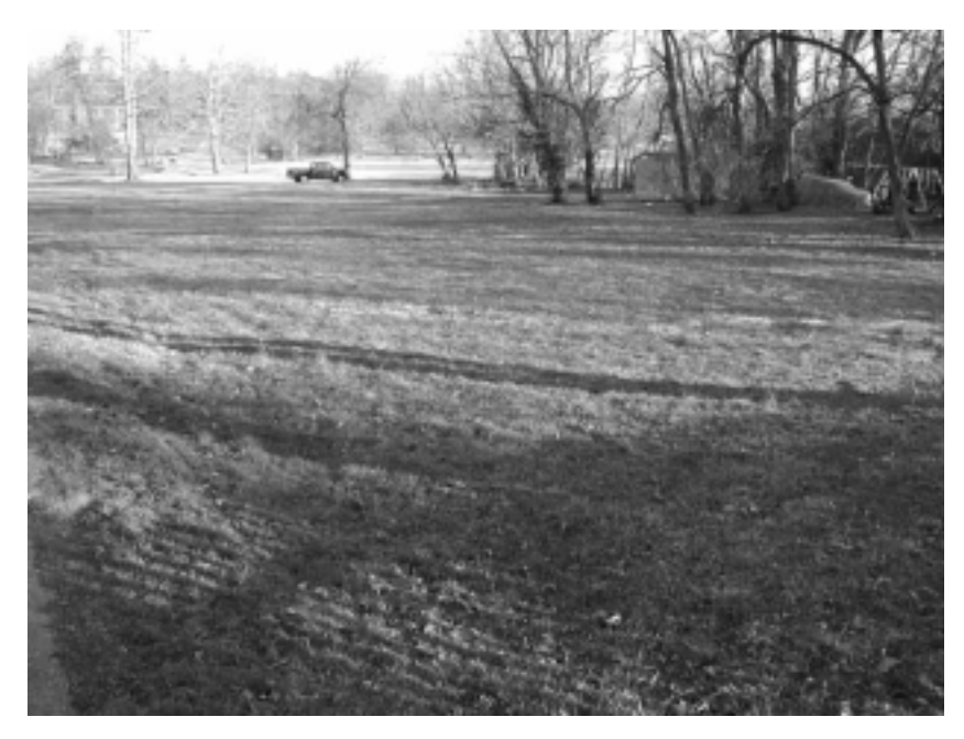
Figure 1: An apparently empty lot, adjacent to my house in Midway, Kentucky.

There also is a long-standing scholarly literature that deals with these things. In the case of rural lands, the stories are mostly of the promise of reconstruction and the thirteenth amendment, the claims of manumitted slaves to land after the Civil War, and the success, or failure through court-ordered decisions, of that rural component of post-bellum, southern rural life. Not as well documented, but of equal interest in my part of the Upper South are the numerous all-Black villages and urban enclaves, some of which still persist, many of which were generational way stations in the first leg of the Great Migration to the north and west. Perhaps in this little deed-tracing exercise was the opportunity to glimpse not just the creation of African-American enclaves in at least one small southern town, but also the mechanisms by which this property transfer actually took place. I had seen archival evidence of that process in another project in St. Louis dealing with the same early twentieth-century time period, a certain scheme where White-owned realty companies advertised in