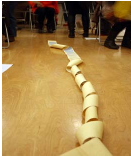
Figure 6: Scroll containing Sand's poem "She Had Her Own Reason for Participating."

During the residency, both Imatani and Sand became interested in and propelled by maps they found in the files, which had been created by activist groups to obtain permits to hold marches in the city. Sand is working with one map in particular, that of the 1978 Women's Nightwatch march in downtown Portland. 70 At the Northwest Archivists Conference, Sand reflected on her experience of working with the map (and the surveillance files in general), stating that, "one march, one pamphlet, or one map