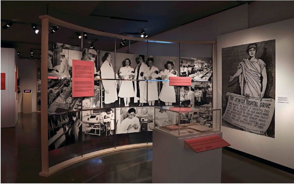
FIGURE 1 Installation view, Shalom Montreal: Stories and Contributions of the Jewish Community, McCord Museum.

of members of the Jewish Diaspora in Montreal is accompanied by an account of Canadian immigration policies during each time period.