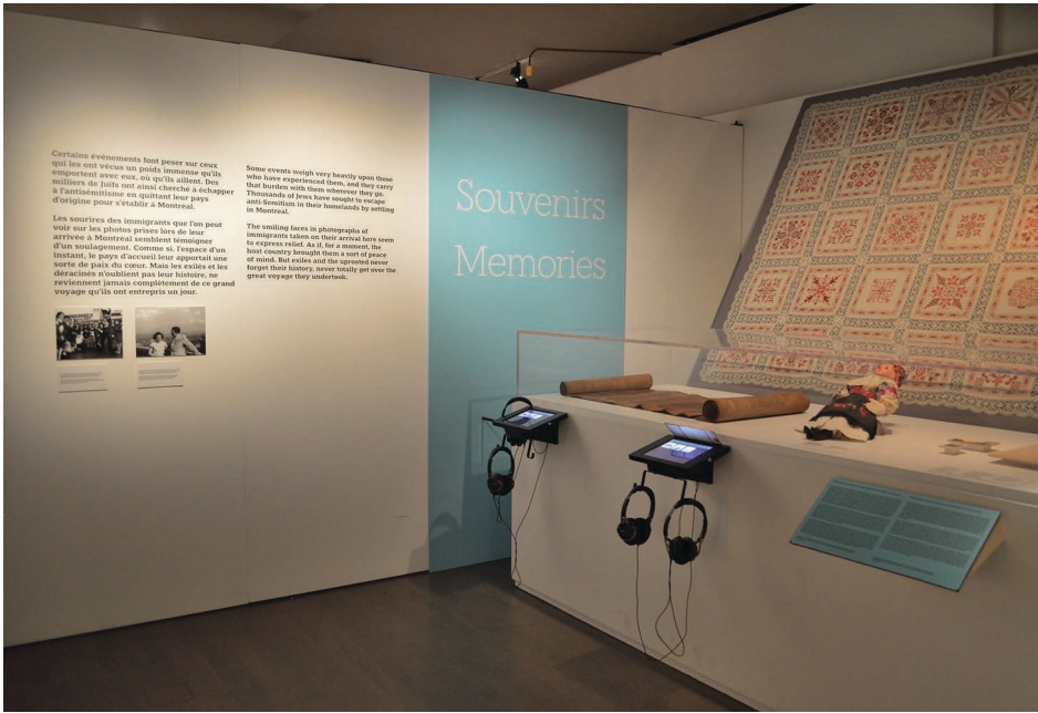
FIGURE 3 Installation view, Shalom Montreal: Stories and Contributions of the Jewish Community , Musée McCord Museum.

within the exhibition, this combination reinforces viewers' awareness that some of these archival documents, objects, and textiles are the only surviving pieces of culture left to families fleeing the war.