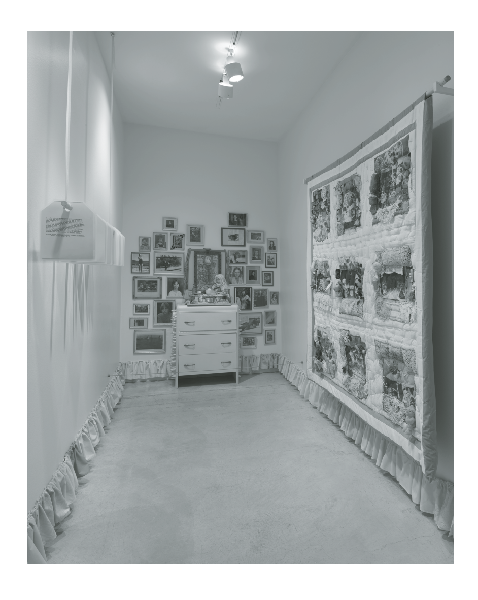
FIGURE 2 Carole Itter, The Pink Room: A Visual Requiem, 1997–2004, mixed media (additional photographs by Michael de Courcy, E. Rausenberg and Cheryl Sourkes), dimensions variable. Collection of the Vancouver Art Gallery, Gift of the Artist