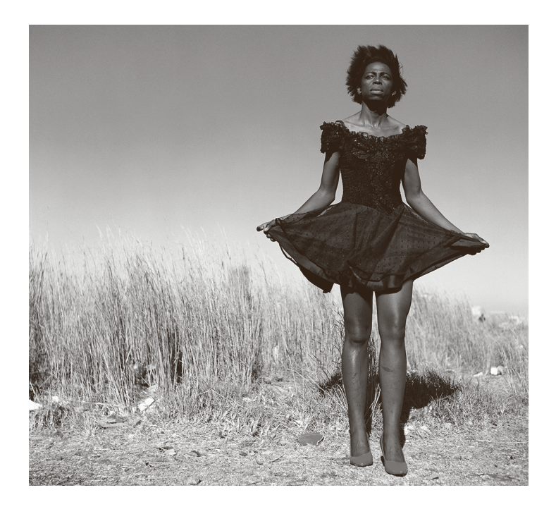
FIGURE 5 Zanele Muholi, Miss D'Vine II, from the series Miss D'vine, 2007, chromogenic print, © The artist. Source: Courtesy of the artist and Stevenson, Cape Town and Johannesburg.

LGBTQ+ visibility by representing transgender women in rural areas around Cape Town and Johannesburg. By placing her subjects in contexts similar to those of ethnographic photography of Africa, her work creates upheavals in perceptions of femininity, of the agency of the contemporary Black body, and of the historicity of the colonial gaze.