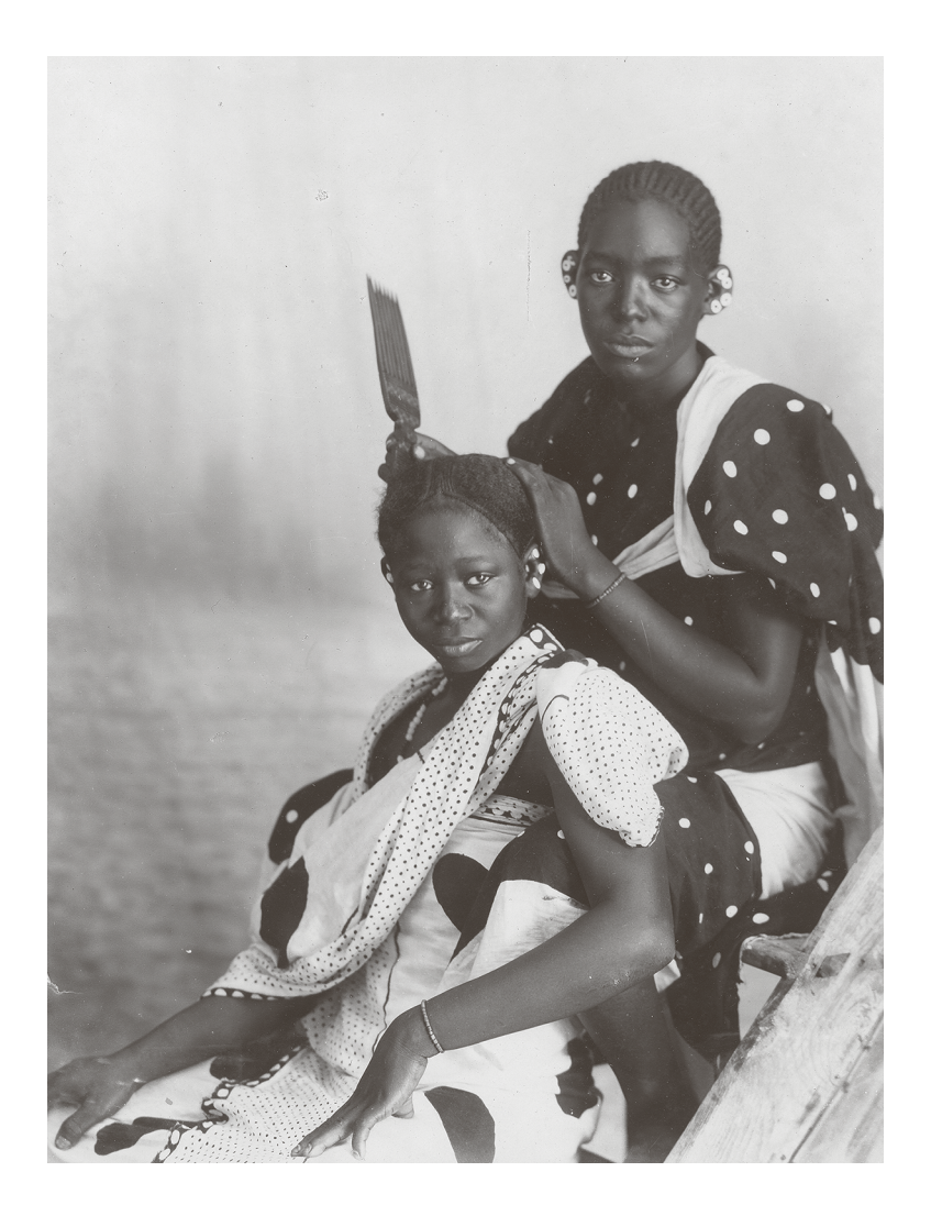
FIGURE 1 A.C. Gomes & Sons, Natives [sic] Hair Dressing, Zanzibar, Tanzania, late 19th century, collodion printed-out print.