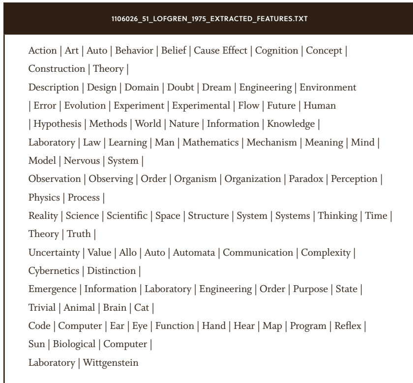
FIGURE 1 Extracted entities from Heinz von Foerster's correspondence.

While the N-grams still contained a great deal of noise, especially frequencies of words that did not appear germane to cybernetics, some cybernetic terms that appeared frequently together (e.g., neuron , impulse , measure ) did surface. After removing stop words, the programmer used the cybernetic terms/inputs to further refine the list of entities to be used in the machine-learning phase to classify the documents. The next step was to extract entities that include these cybernetic terms and the names of associated persons, such as individuals mentioned in the documents (figure 1).