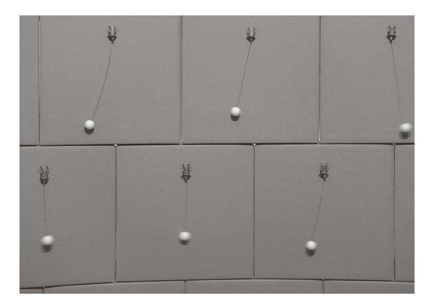
FIGURE 2 Detail from Zimoun, 278 prepared DC motors, cotton balls, cardboard boxes, 2021.