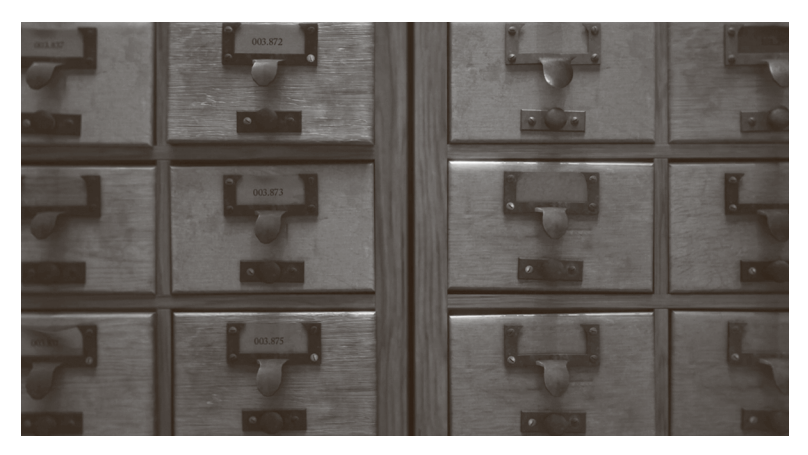
FIGURE 7 Detail from Fiona Tan, Archive (New Westminster, BC: New Media Gallery, 2019), single-channel HD projected video with sound.