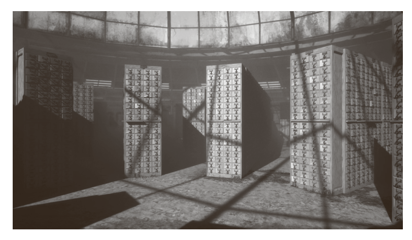
FIGURE 6 Detail from Fiona Tan, Archive (New Westminster, BC: New Media Gallery, 2019), single-channel HD projected video with sound.