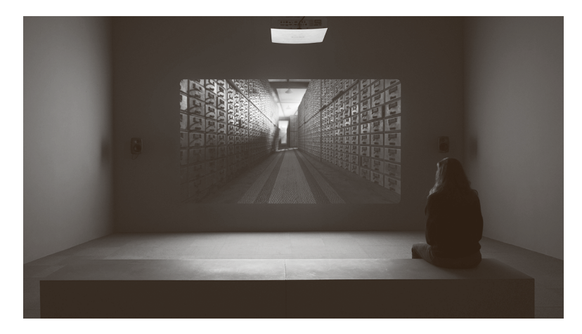
FIGURE 5 Fiona Tan, Archive (New Westminster, BC: New Media Gallery, 2019), singlechannel HD projected video with sound.

1895, with the goal (in the words of Archivaria contributor Eric Ketelaar) of "putting together a universal bibliographic repository: an enormous card index of abstracts (ultimately fifteen million cards!) of all books and all journal articles published all over the world since the invention of the printing press." Otlet and La Fontaine expanded the Dewey Decimal Classification (DDC) system as part of their work, and they intended the code (in contrast to the principles outlined by Jenkinson in the Manual for the Arrangement and Description of Archives ) to guide subject cataloguing for a central global repository – not only for library materials but also for the classification of files. Their project was short-lived, as the building housing Otlet's collection and cards (called the Mundaneum) was commandeered during the Second World War by the Nazis, who destroyed much of its contents. Otlet died shortly after this, but his theories and approaches to information management and universality left a lasting impact.<sup>8</sup>