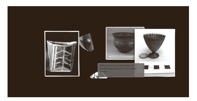
FIGURE 4 Detail from Elizabeth Price, A Restoration, 2016, two-channel projected video with sound.