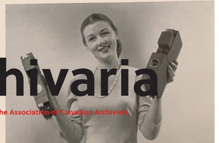
Triplex Microfilmer. General ledger sheets are microfilmed at 24 to 1 (left); or letters at 24 to 1 (center) by the Standard method; and tab cards fronts only, or fronts and backs by the Duo method (right) at 24 to 1 or 28 to 1.

The Journal of the Association of Canadian Archivists